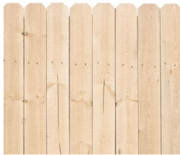
Dog eared, solid board