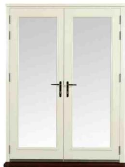
French Door with full lite