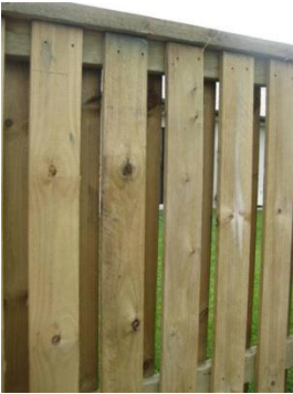
Capped, alternating boards